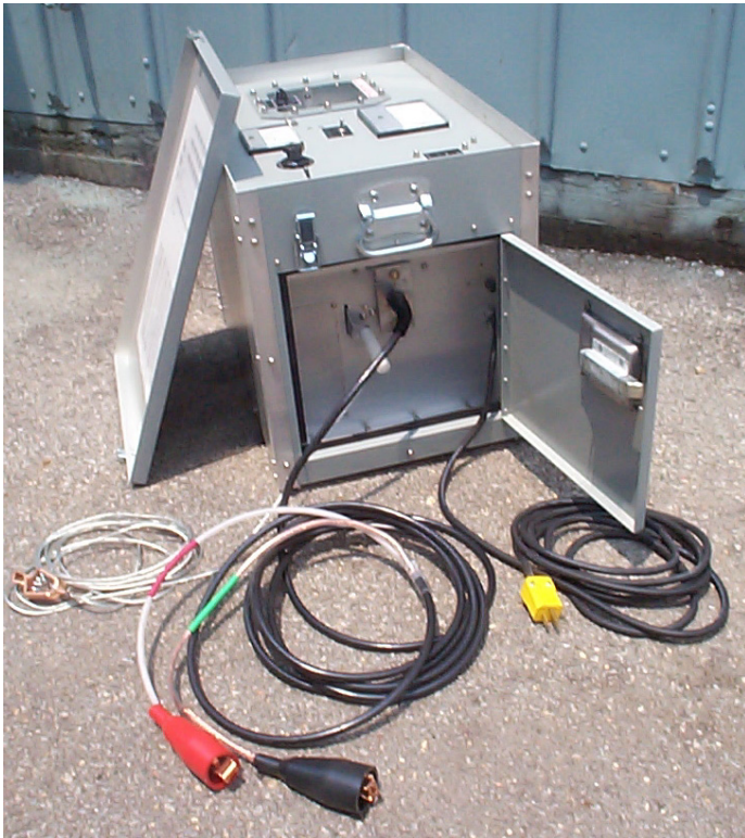
B-.45 shown with included leads.