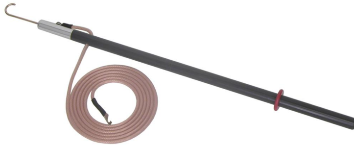
ES30 Earthing stick

If you require a different output voltage test system, please contact us with your specification and we will quote for a custom design.