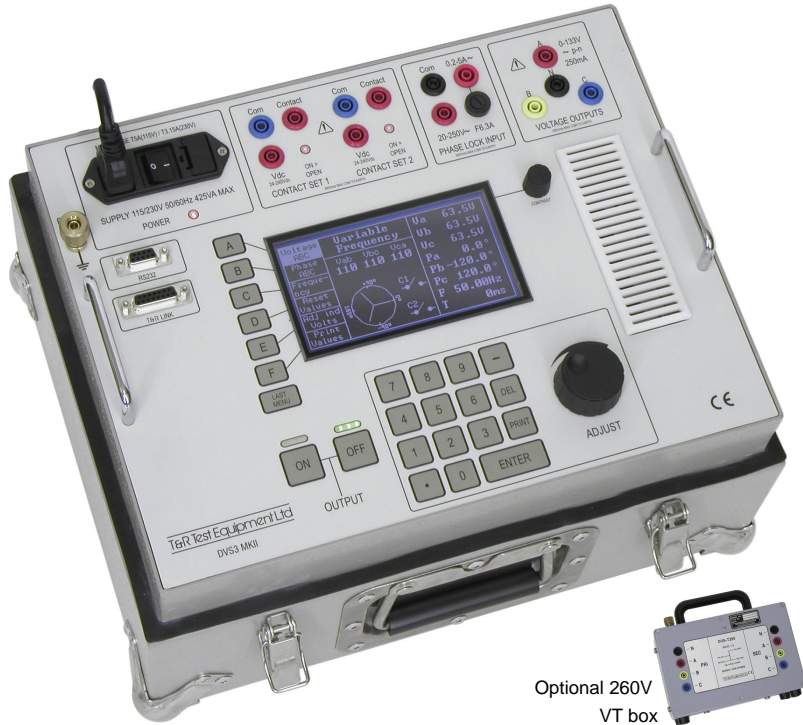
Optional 260V VT box