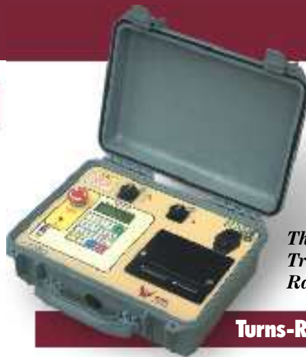
Three Phase Transformer Turns Ratio Test Set

The OID is available for clear display of all instrumentation (OID pictured in custom control console on pg. 4). An OID offers complete programming flexibility. This allows customization for automated testing and the ability to program more safety interlocks to protect the test set as well as the test specimen. Optional tests, such as applied or induced potential can more easily be added to an OID equipped system. The OID offers the ability for computer control of the test set. Utilizing the computer control feature reduces the function of the operator to selecting a test, connecting the leads to the test specimen (instructions for lead hook up displayed by software) and initiating the test. The system takes over from there, running the test, recording results and turning the test set off. Easy data transfer to a computer for acquisition and data storage is accomplished via a COM port, not through computer interface cards. As OID equipped system uses a microprocessor based calibration procedure and all key functions of the system are monitored, alerting the operator with written messages if there is a problem with testing. Overall reliability, functionality and flexibility are increased with the use of an Operator Interface Display.