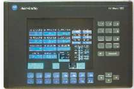
Control Panel, Operator Interface