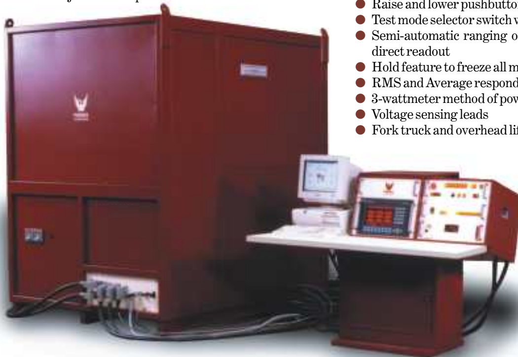
Transformer Test System with Control Console