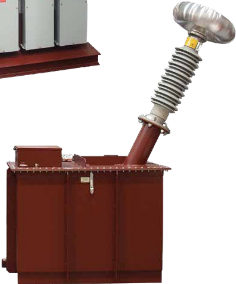
Hipot for Applied Potential Testing

PHENIX offers a complete line of AC dielectric transformers with a variety of ratings available to meet any need. Applied potential testing is necessary to verify insulation integrity in reference to ground. PHENIX can also integrate an existing hipot with a transformer test system. For detailed specifications, refer to PHENIX brochure #60404.