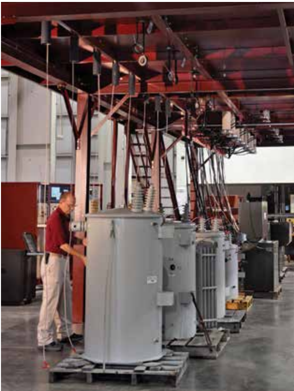
Automated Distribution TTS