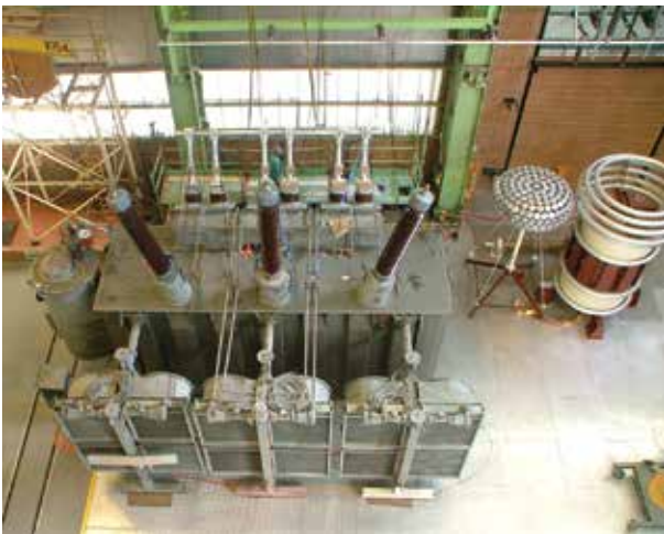
Large Power TTS

For the customer interested in increasing production while decreasing labor costs, Phenix Technologies can provide fully-automated distribution transformer test systems designed for high volume testing. The automated test systems are custom-designed and built for the individual needs of the customer. Multiple test stations with single connection hook-ups can be configured to simultaneously perform the customer's desired testing protocol on each transformer. The industrial micro-processor based test system with HMI has proven to be highly reliable under stringent testing applications. Operator training time is minimal. Both manufacturers and repair facilities benefit greatly from the efficiency of automated test systems. Total test time can be reduced to as low as 90 seconds or less per transformer depending on the tests being performed and the testing sequence.