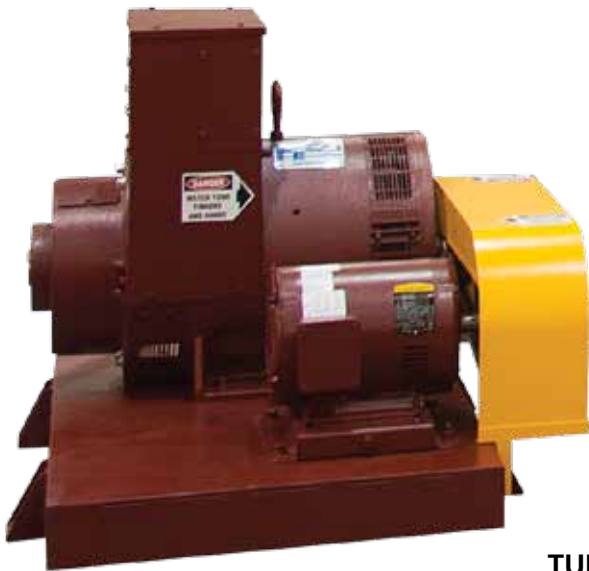
Motor Generator Set for Induced Potential Testing