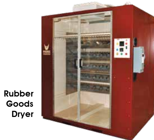
Rubber Goods Dryer

High Voltage • High Current • High Power Test Systems and Components