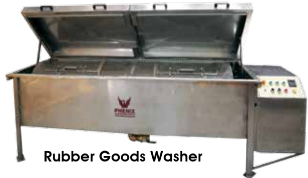
Rubber Goods Washer