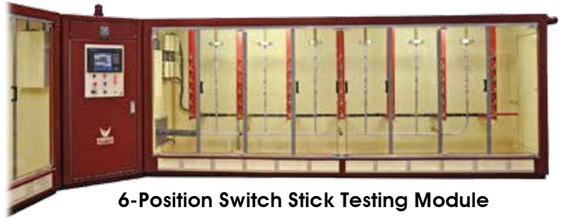
6-Position Switch Stick Testing Module