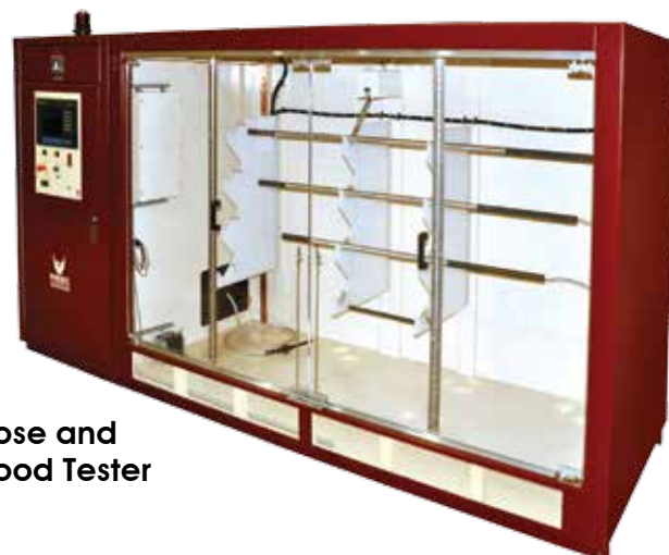
Hose and Hood Tester