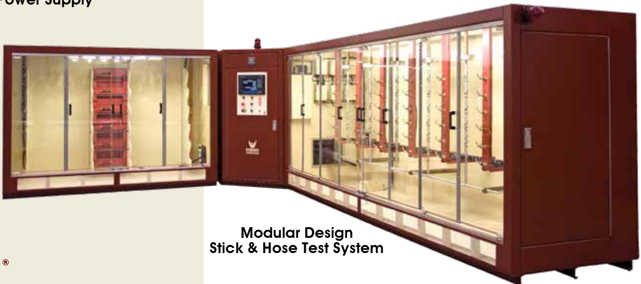
Modular Design Stick & Hose Test System

Our Modular Design options are beneficial to the customer that tests a variety of different rubber products. The test chambers are separate from the power supply and control panel. Different configurations allow customers more flexibility inside their facility. Systems can be built in L-shapes or in a straight line.