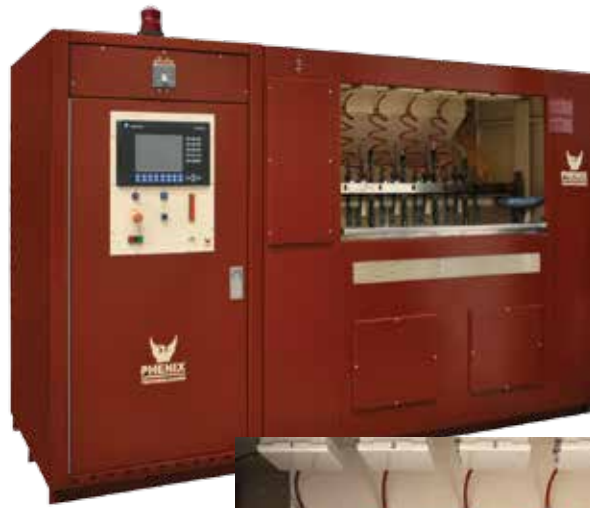
Glove, Sleeve Testers