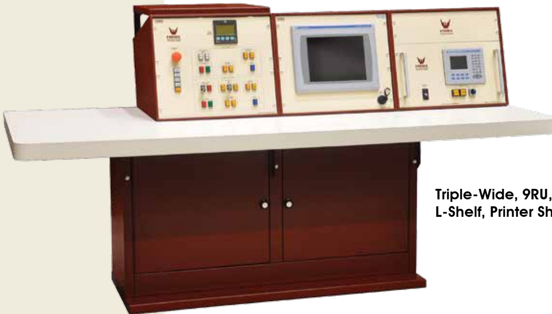
Triple-Wide, 9RU, L-Shelf, Printer Shelf