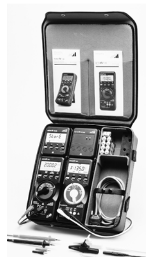
F840 (with sample contents)