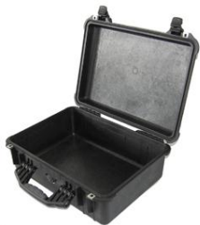
Cable plastic case