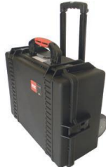
Cable plastic case with wheels