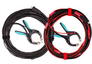
Current and Sense cables with TTA clamps

All specifications herein are valid at ambient temperature of + 25 °C and recommended accessories. Specifications are subject to change without notice. Specifications are valid if the instrument is used with the recommended set of accessories