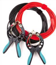
Voltage Sense cables with TTA clamps