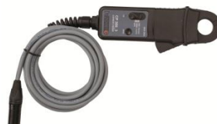
Current clamp 30/300 A with extension 5 m (16.4 ft)